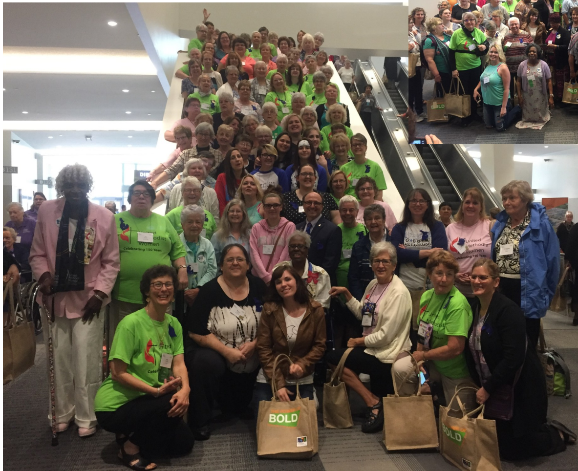
Michigan Delegation to Assembly 300 people Second largest delegation!!