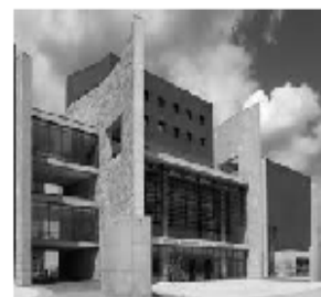
National Underground Railroad Freedom Center