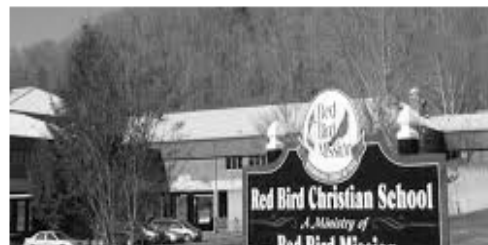
Red Bird Mission

Tour Arranged By Countryside Tours, Inc For More Information Call 616.636.4628 or toll-free 800.784.3828