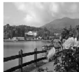
Lake Junaluska Conference & Retreat Center

Holt United Methodist Church, 2321 N. Aurelius Road