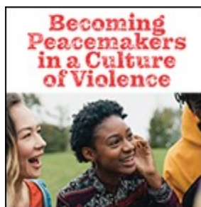
A Youth Study: Becoming Peacemakers in a Culture of Violence 2021 Spiritual Growth Mission Study