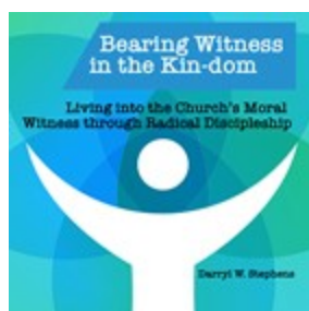
Bearing Witness in the Kin-dom: Living Into the Church's Moral Witness Through Radical Discipleship 2021 Spiritual Growth Mission Study