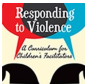
A Children's Study: Responding to Violence 2021 Spiritual Growth Mission Study