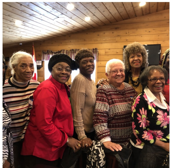
Members of Greater Detroit