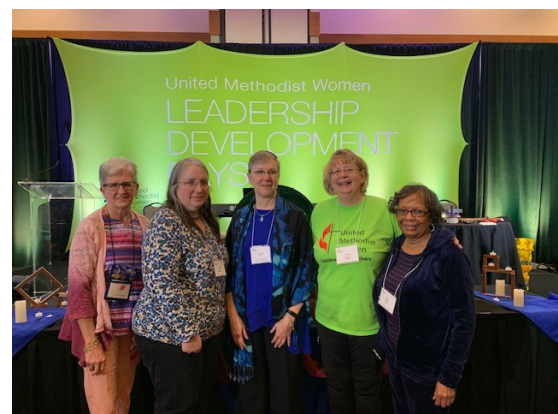
Leadership Development Days in Tempe, AZ