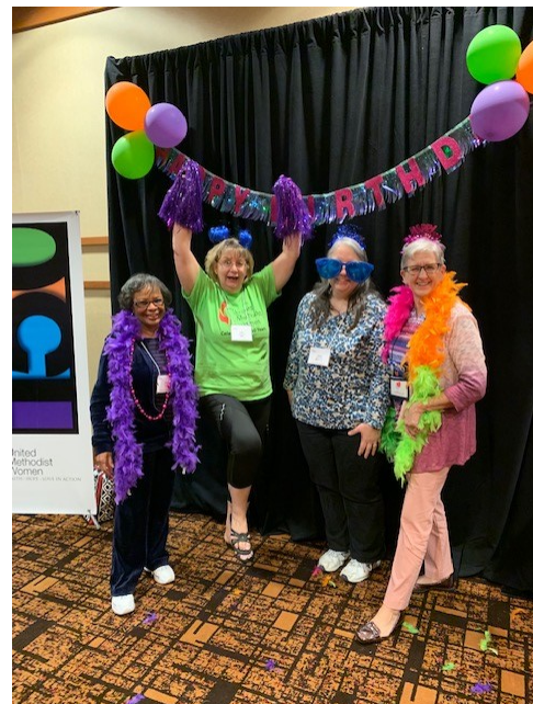
Leadership Development Days